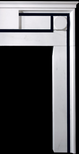
Pattern No. 4