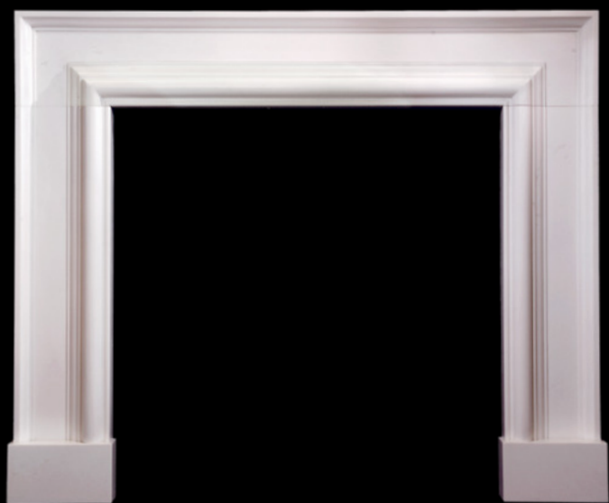
Pattern No. 1