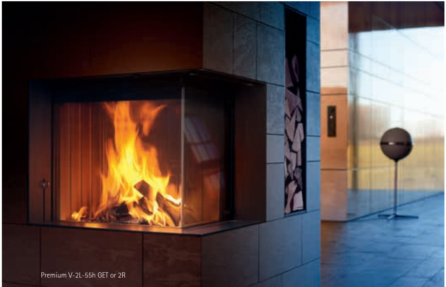
Premium V-2L-55h GET or 2R