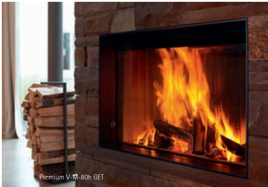
Premium V-M-80h GET