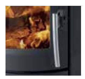
Ergonomically designed handle