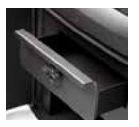
Large capacity ash pan

Aura 1 has a large fire chamber with ample fuel storage space beneath the innovative door which opens when pressed gently.