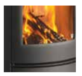
Combustion chamber designed to make it easy to light and clean the stove

The Shape 2 is offered as either a dedicated woodburning or multi-fuel model, and features a tall firebox with a curved window for a breath-taking flame view. These versatile stoves are available in either top or rear flue options and feature Varde's AirBox system for an external air supply if required.