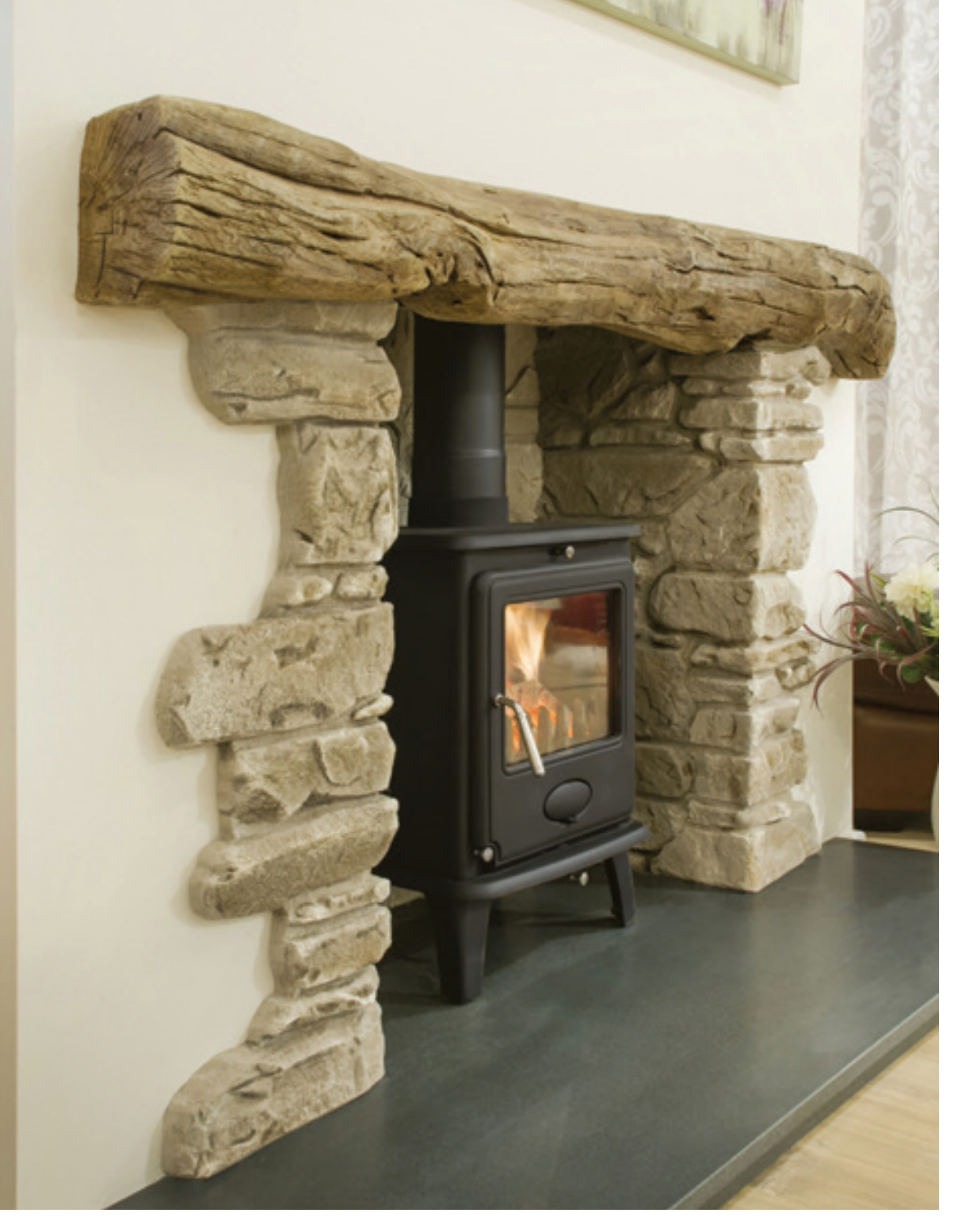
Shown with our outstanding 60" wide (1524mm) Fowey beam

So, so realistic, our reproduction stone chamber and stone facia ooze the charm of the original natural stone blocks the design originated giving your fireplace a natural and impressive look with the character and workmanship of true craftsmen. Creates an absolutely visual delight when used in conjunction with one of our beams. Designed to allow installation into most chimneys without the dimensional constraints of solid stone blocks. Will take centre stage to every room that this masterpiece adorns.