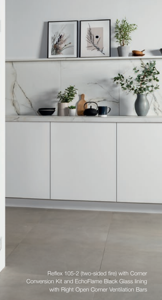
Reflex 105-2 (two-sided fire) with Corner Conversion Kit and EchoFlame Black Glass lining with Right Open Corner Ventilation Bars