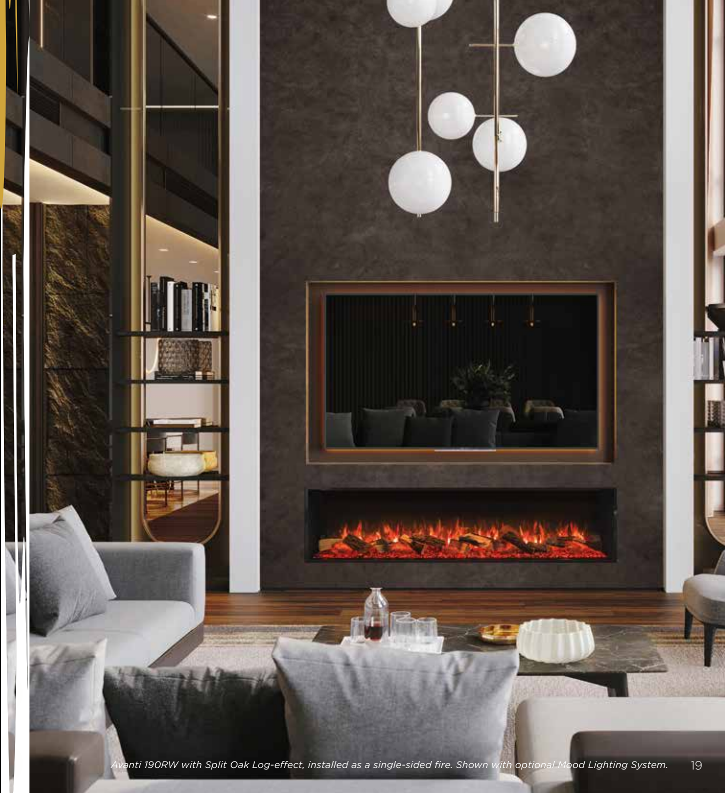
Avanti 190RW with Split Oak Log-effect, installed as a single-sided fire. Shown with optional Mood Lighting System.

See pages 3, 7, 11 & back cover for additional images