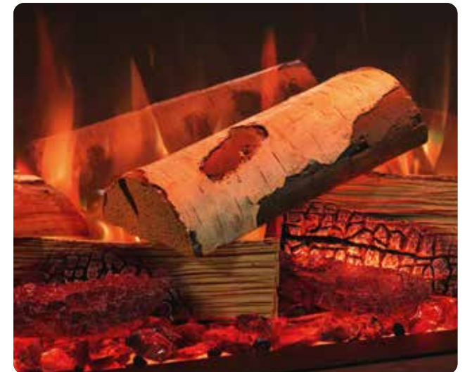
Optional Split Silver Birch Log-effect

Avanti 110RW with Split Oak Log-effect, installed as a two-sided corner fire.