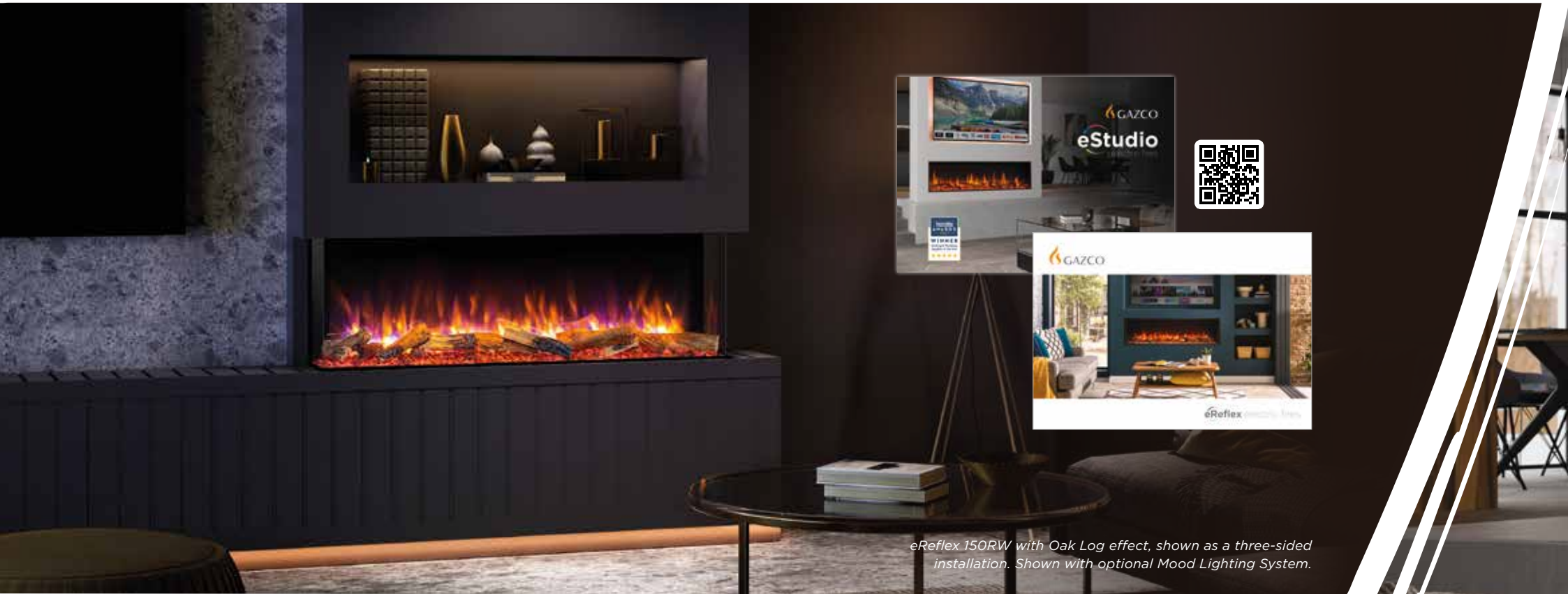
eReflex 150RW with Oak Log effect, shown as a three-sided installation. Shown with optional Mood Lighting System.

The Stovax Heating Group's electric fire collection also includes the Gazco eReflex and eStudio ranges.