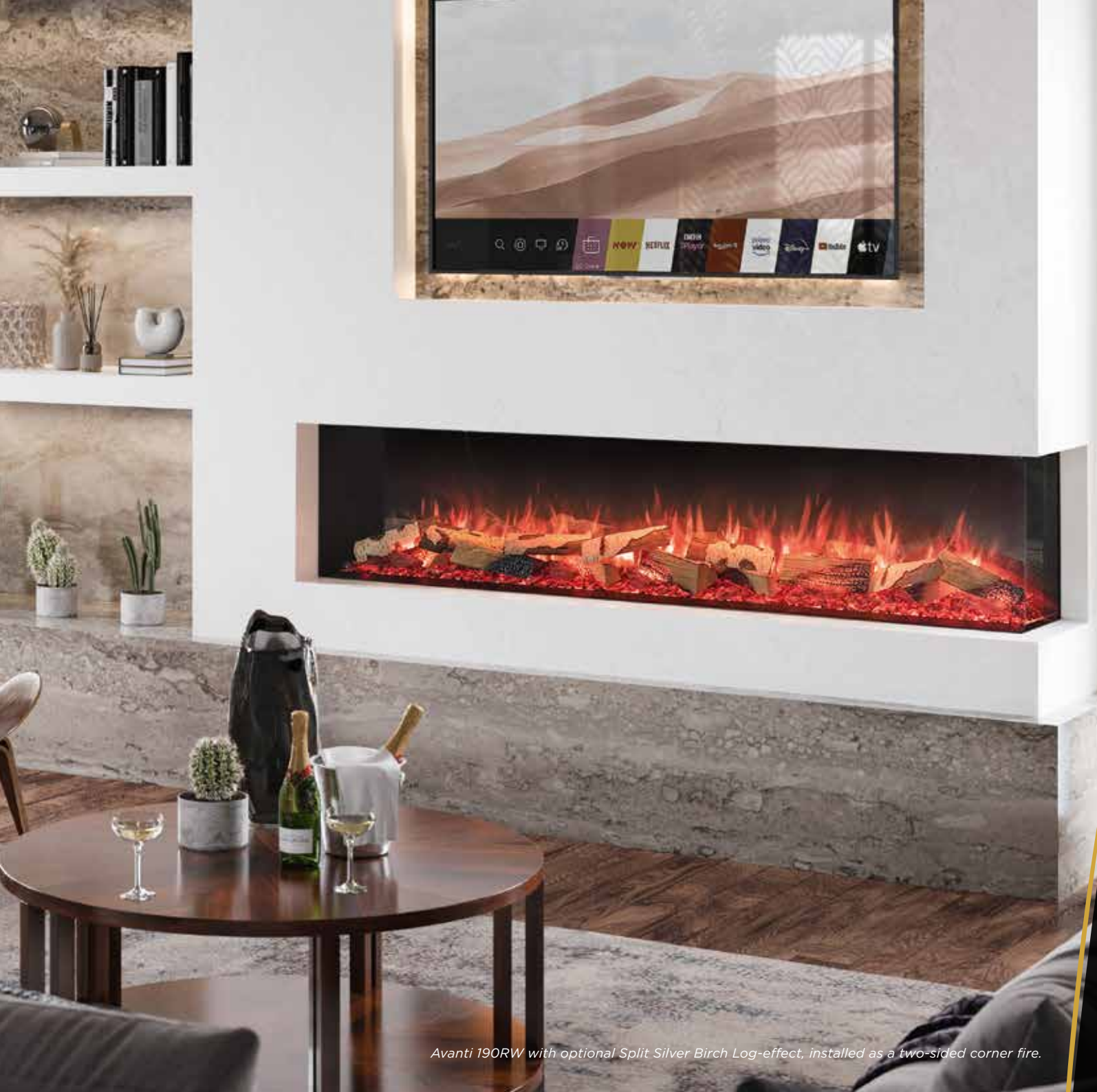
Avanti 190RW with optional Split Silver Birch Log-effect, installed as a two-sided corner fire.