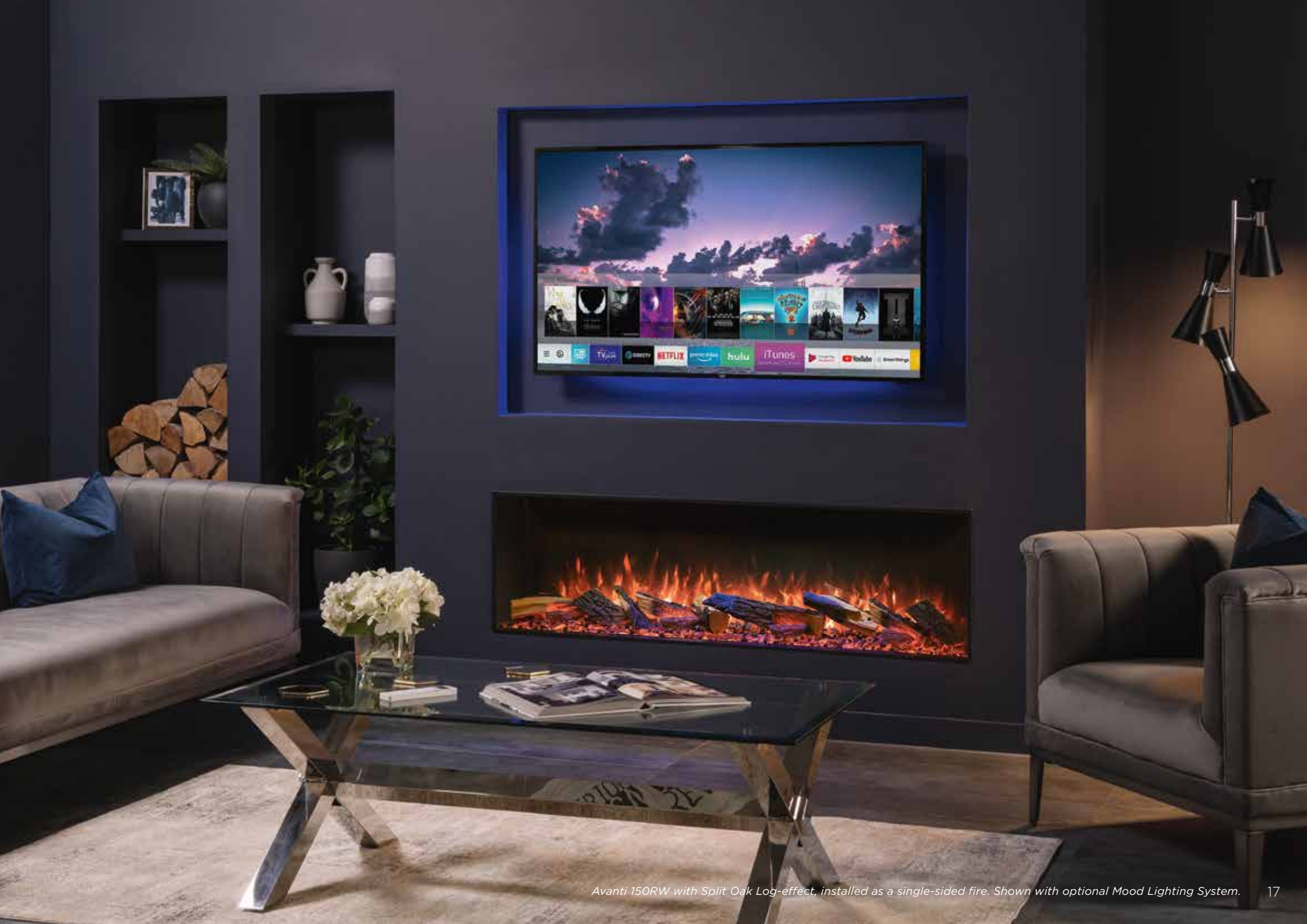
Avanti 150RW with Split Oak Log-effect, installed as a single-sided fire. Shown with optional Mood Lighting System.