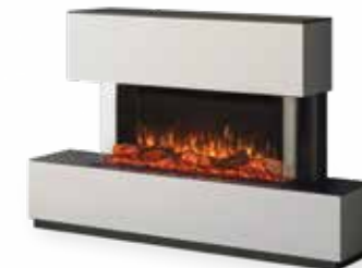
Avanti 110RW with Split Oak Log-effect, installed with Milazzo Suite floating shelf and four top sections in white.

The elegant Milazzo suite offers an easy installation for the Avanti 110RW. See page 14 for more information.