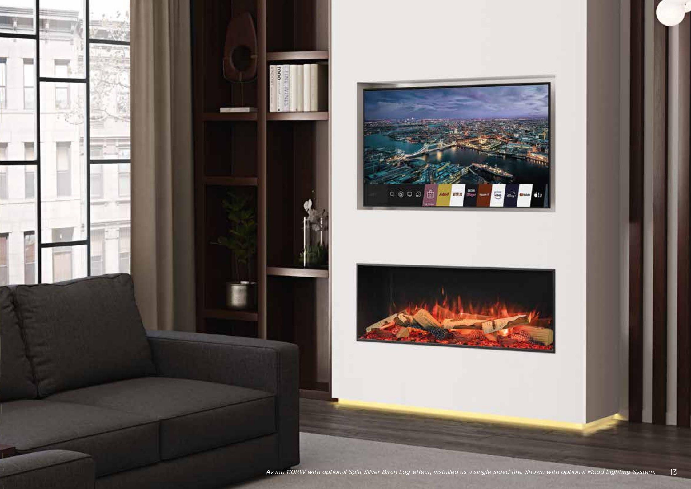
Avanti 110RW with optional Split Silver Birch Log-effect, installed as a single-sided fire. Shown with optional Mood Lighting System.