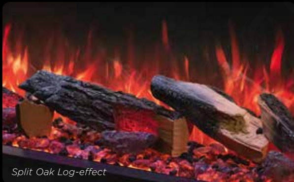
Split Oak Log-effect

See pages 3, 7, 11 & back cover for additional images