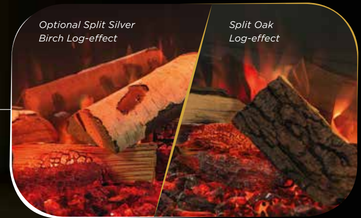
Split Oak Log-effect