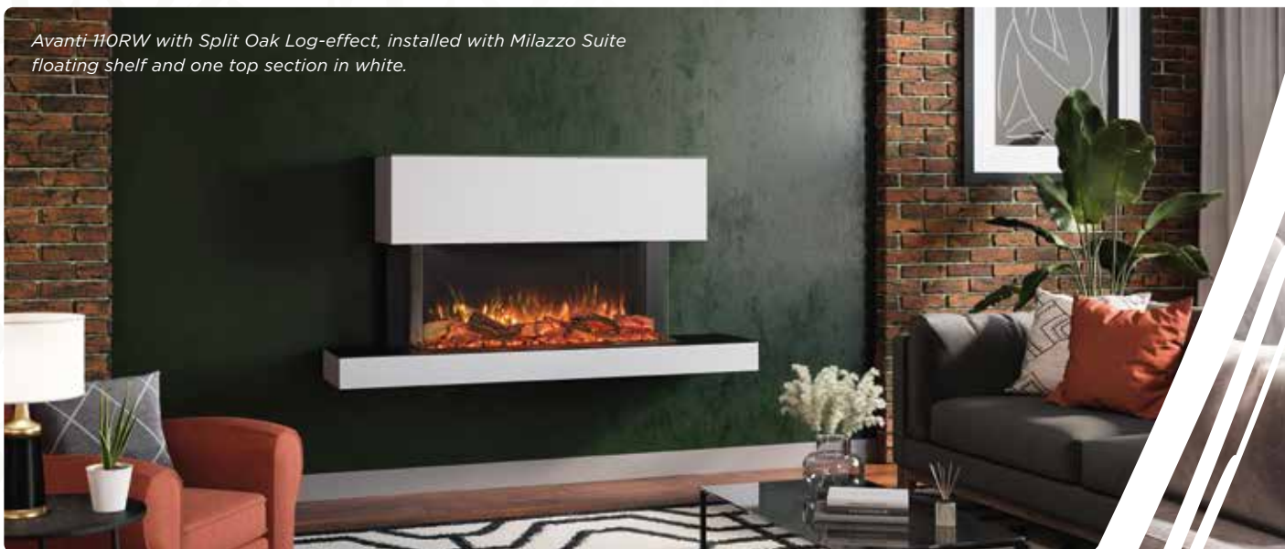
Avanti 110RW with Split Oak Log-effect, installed with Milazzo Suite floating shelf and one top section in white.

Fixing flat against a wall for a quick and easy installation, the Milazzo's modular design can be tailored to create a floating focal point or floor-to-ceiling centrepiece.