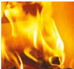
Expansive flame visuals

See front and rear cover for additional images.