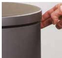
Ergonomically correct adjustment of the air vent