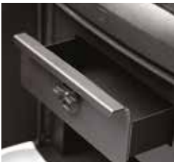
Large capacity ash pan

Aura 1 has a large fire chamber with ample fuel storage space beneath the innovative door which opens when pressed gently.