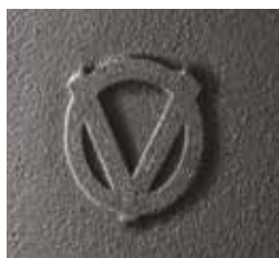
Door, top plate and grate made of high-quality cast iron