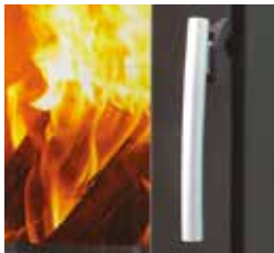
Ergonomically designed handles