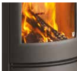
Combustion chamber designed to make it easy to light and clean the stove