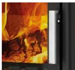
Ergonomically designed handles