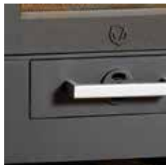
Easy access ash pan