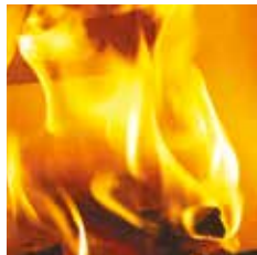
Expansive flame visuals