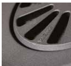
Cast iron disc grate in base for easy ash removal