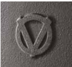
Door, top plate, grate and flue made of high-quality cast iron