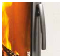
Ergonomically designed handle