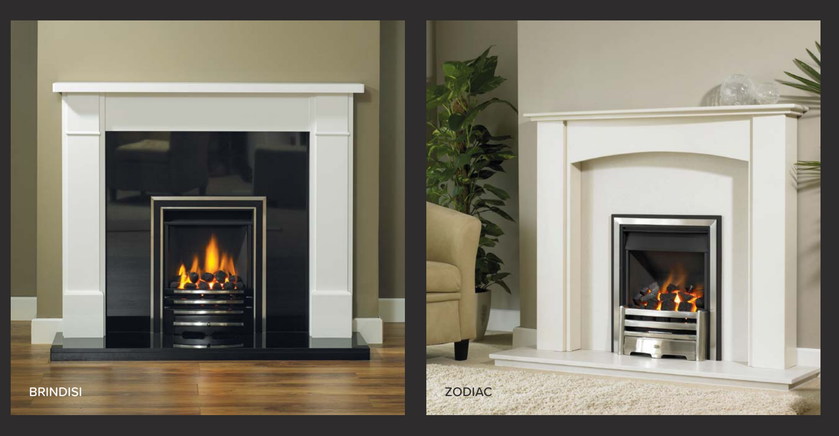
With a choice of over 30 wood finishes you can guarantee a perfect combination to complete your interior style.

The traditional designs also look great painted, blending classic design with modern interiors.