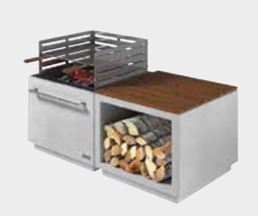
Air - BBQ Grill (965-010) Horizontally configured with optional wooden top (965-140)