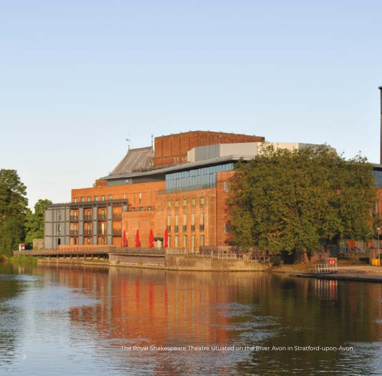
The Royal Shakespeare Theatre situated on the River Avon in Stratford-upon-Avon