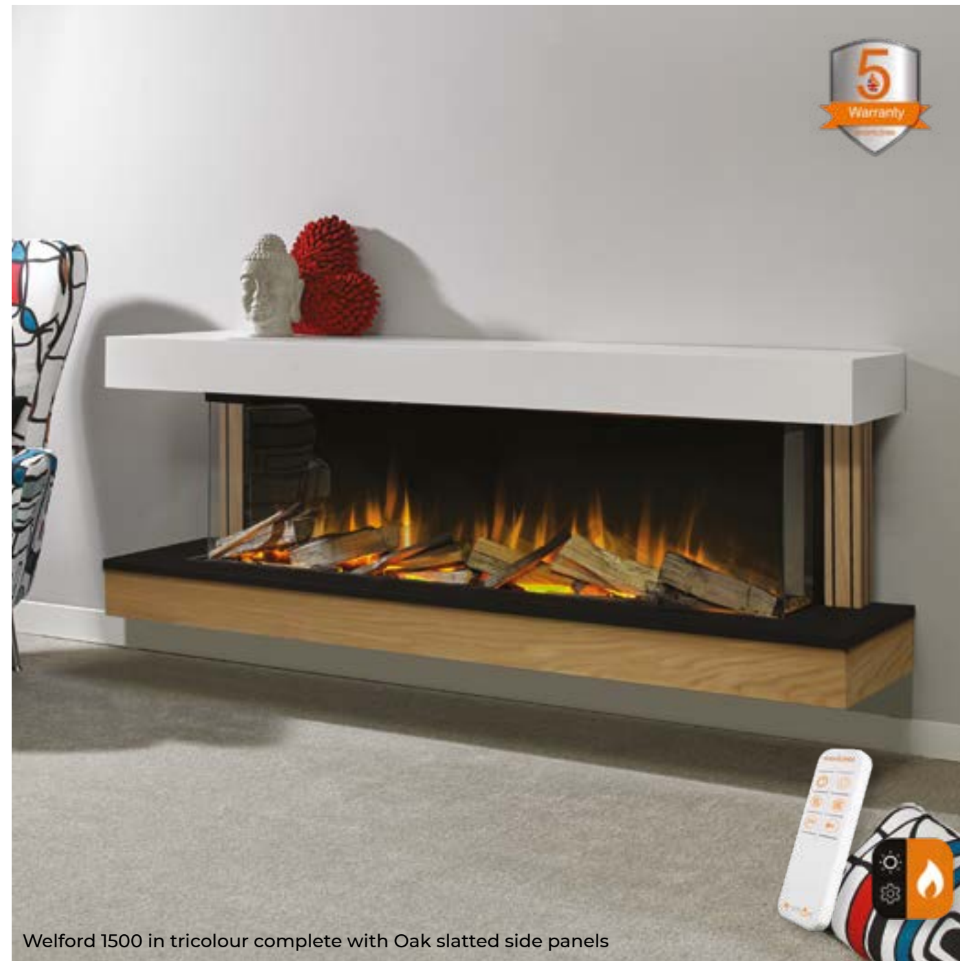
Welford 1500 in tricolour complete with Oak slatted side panels