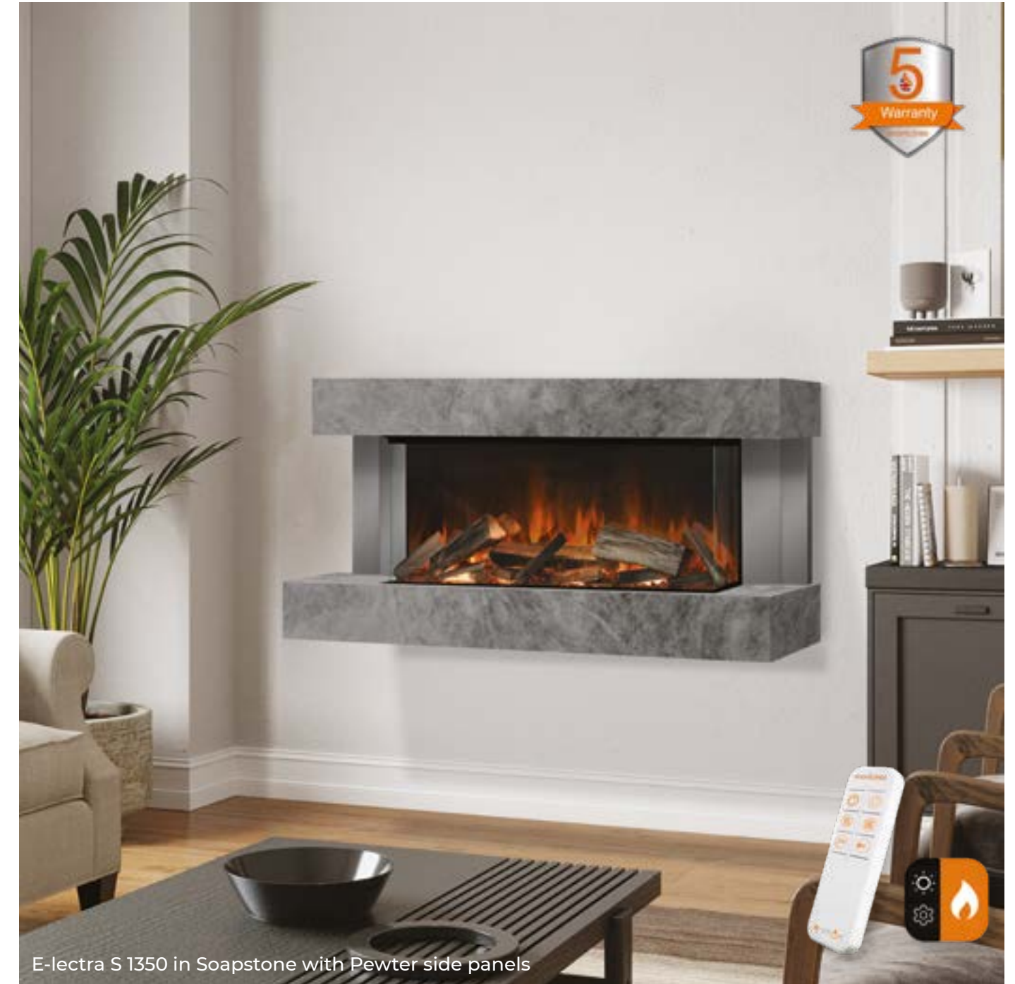
E-lectra S 1350 in Soapstone with Pewter side panels