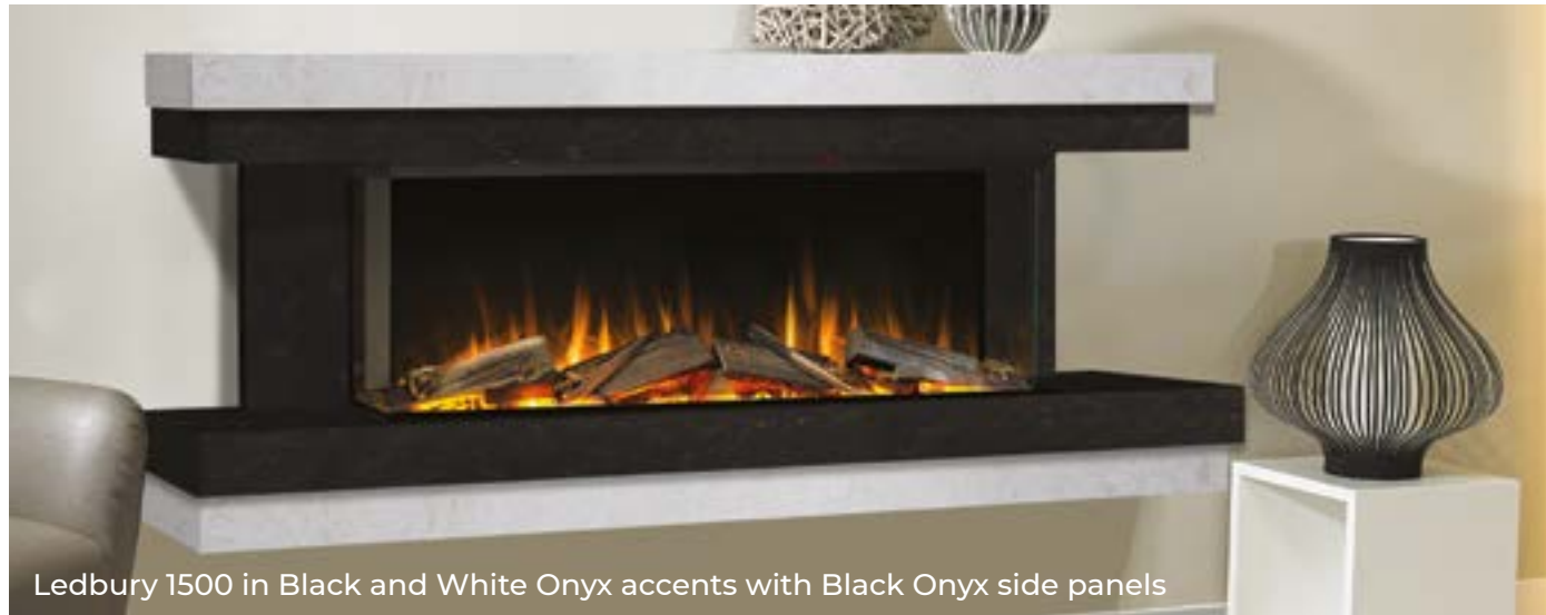
Ledbury 1500 in Black and White Onyx accents with Black Onyx side panels