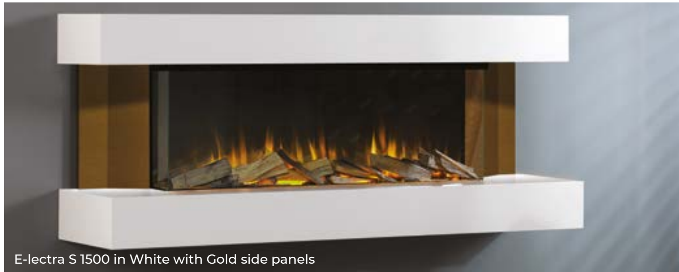
E-lectra S 1500 in White with Gold side panels