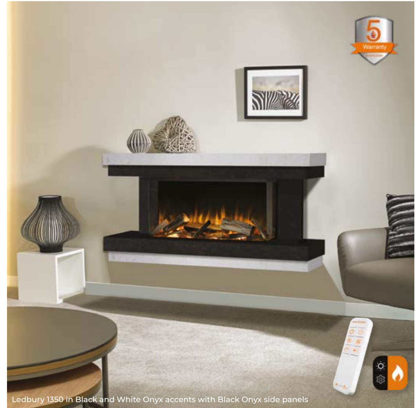
Ledbury 1350 in Black and White Onyx accents with Black Onyx side panels