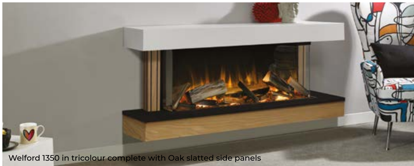
Welford 1350 in tricolour complete with Oak slatted side panels