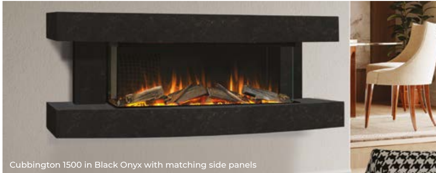
Cubbington 1500 in Black Onyx with matching side panels