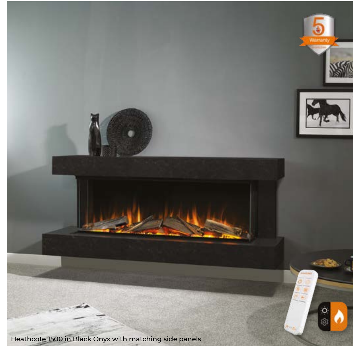
Heathcote 1500 in Black Onyx with matching side panels