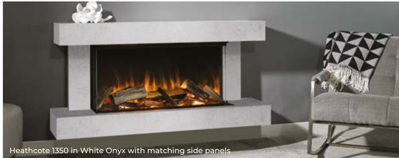
Heathcote 1350 in White Onyx with matching side panels