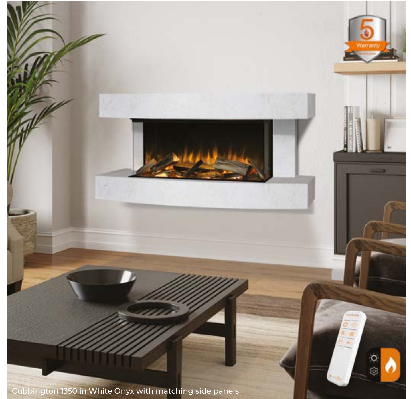
Cubbington 1350 in White Onyx with matching side panels