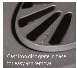
Cast iron disc grate in base for easy ash removal

Please note, the blanking plate for VARDE Shape 2, VD-100473, is available as an optional extra.