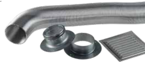
Optional External Air Connection - 80mm

An approved competent person of solid fuel installations should undertake a site survey prior to purchase and must install any VARDE Stove for you. Your VARDE retailer will be able to advise and assist. You may view/download complete installation instructions at our website - www.VARDEstoves.com . These diagrams/dimensions cover some of the basic requirements. All stoves should be installed by a competent person to the requirement of Building Regulations (Document J) and include the fitting of adequate ventilation to ensure safe use. Usually older buildings do not need any additional ventilation for appliances up to 5kW, but modern houses will need additional ventilation in all cases. Some models can be fitted with an optional External Air Kit, or dedicated external air supply, offering a discreet and draught reducing solution to standard room venting.