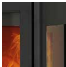
Side windows provide panoramic flame views